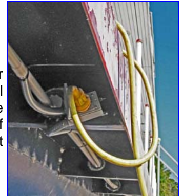
Marine electrical receptacle