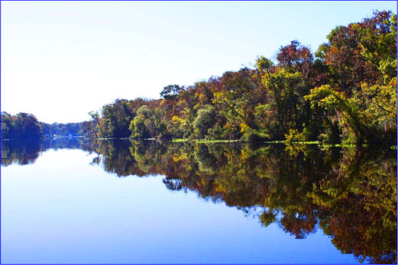
Reflections on Six-Mile Creek