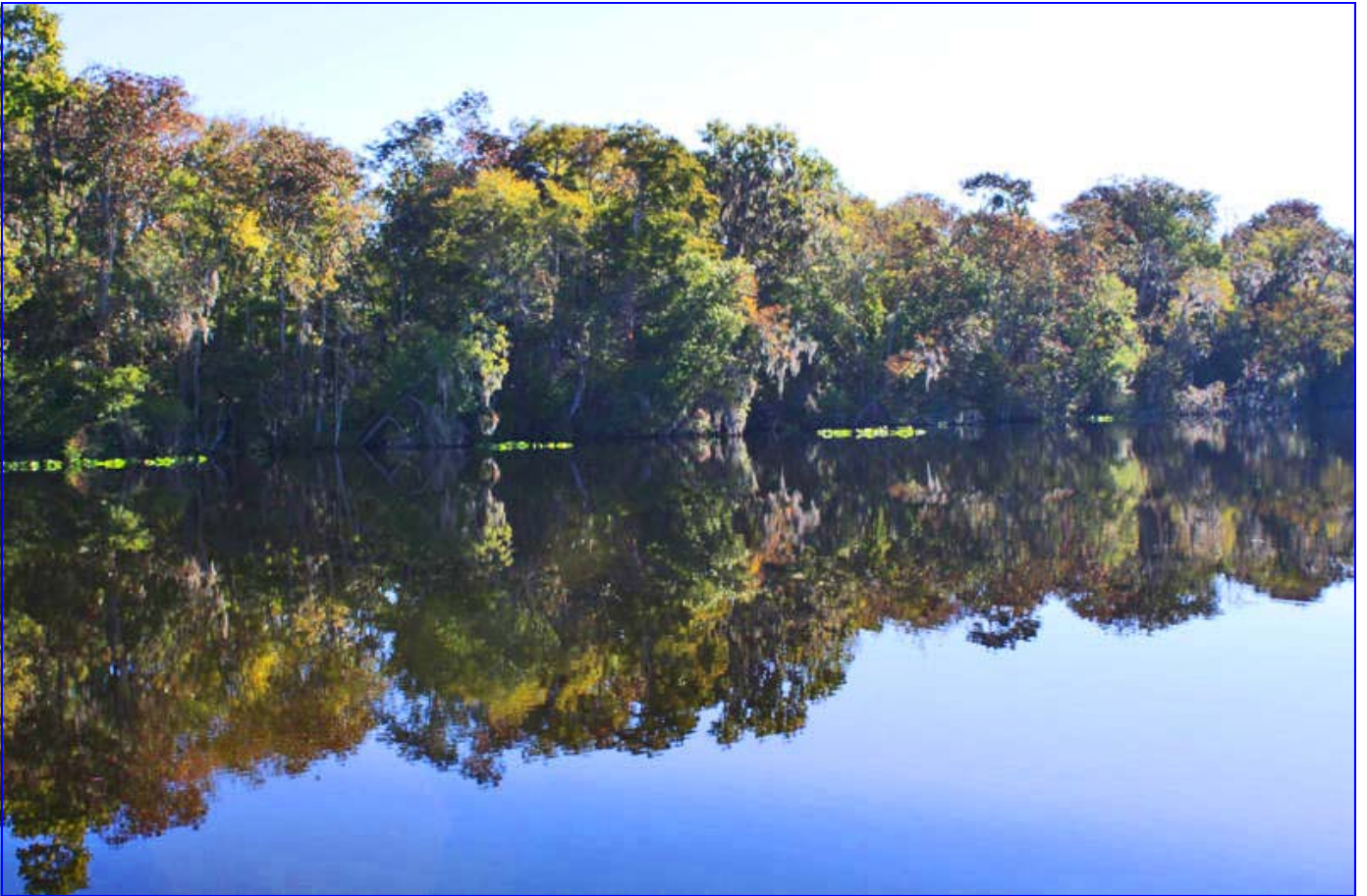
Reflections on Six-Mile Creek