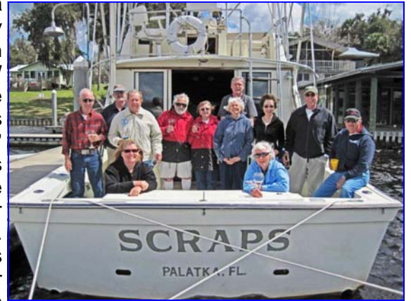
Line handlers & crew

After a period of heavy rain, this day came out clear and cool, with a very strong and gusty NW wind blowing straight into the marinas and private piers where some club members' boats were moored. It was also blowing straight onto the pier in Welaka where our boaters planned to dock. Consequently, most attendees drove their cars instead of their boats to the rendezvous. The O'Connors' boat Scraps did make the windy trip, however, with six aboard. Skipper Gene O'Connor docked her easily in spite of the high wind. Many members were on the pier as Scraps came in, and they helped tie her up. All then enjoyed an impromptu cocktail party on the boat and on the pier, then they climbed the little hill and joined the rest of the party in the restaurant. Afterwards, at home, backing Scraps into its own slip in that high wind was not so easy. A strong gust pushed the boat hard against an old piling and broke it off. In spite of those difficulties, it was an enjoyable afternoon.