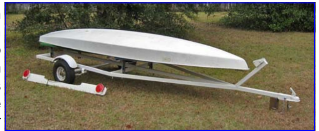
Bob Trail photograph

Club-owned Sunfish – At present, the Club's Sunfish sailboat is on a trailer at Bob and Sue Merritt Trail's San Mateo property and is available for any member to use. Bob has just modified the trailer for more convenient long-term storage. See photo. The Sunfish is designed to "live" this way, upside down, and if necessary to launch from the trailer, the boat can be swung across the bunks, flipped over (it doesn't weigh much), and swung back. The lightbar is removable to preserve the lights and connections. The mast can be bungeed to the trailer frame for moving and the daggerboard & rudder carried in the tow vehicle. It is now ready to roll.