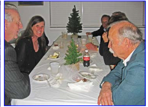
Who are all these well-dressed people?