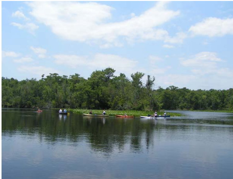
Ocklawaha River 2007