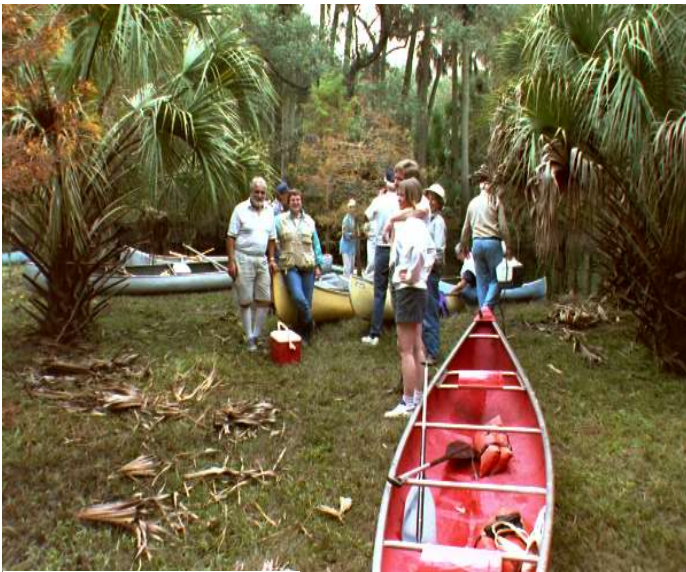
Haw Creek 1997