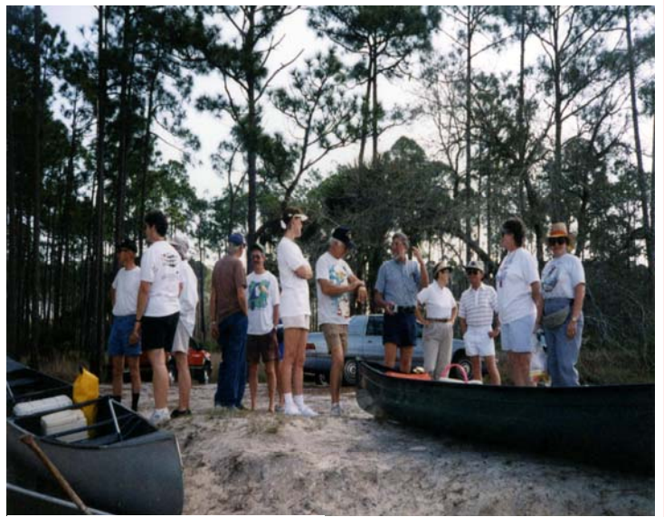
Pellicer Creek 1998