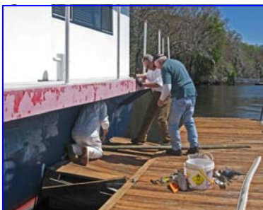
Reattaching floating dock section