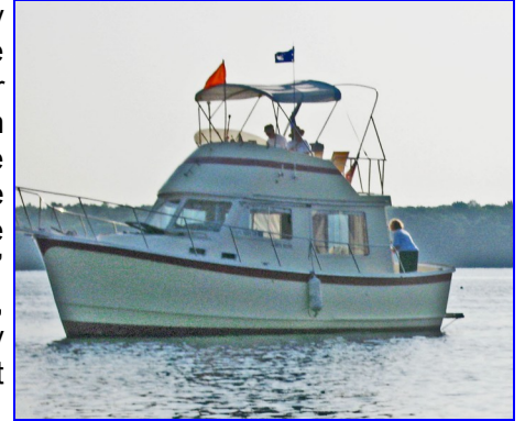
Race Committee start boat Hart's Desire