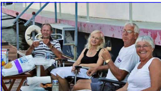
Sunset dock party