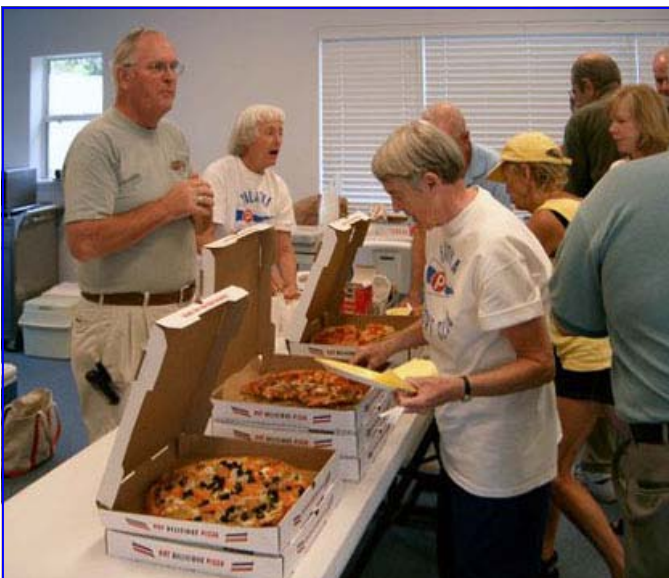
Enjoying Niko's Pizza