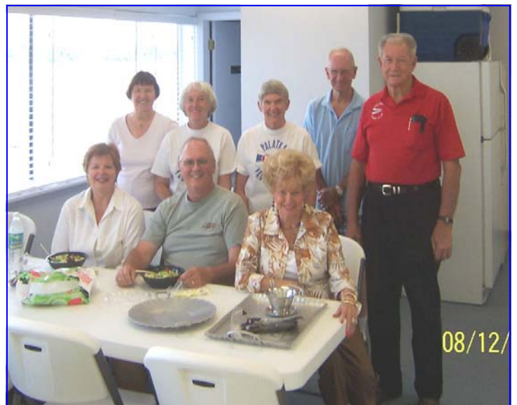
Hosts of "A Day at the Movies"