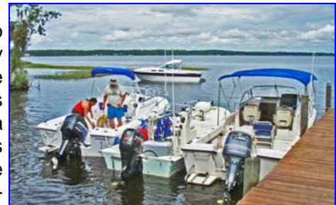
The PYC flotilla