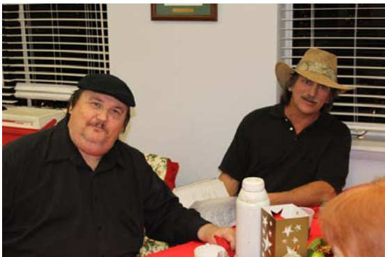
Band "Double Trouble"