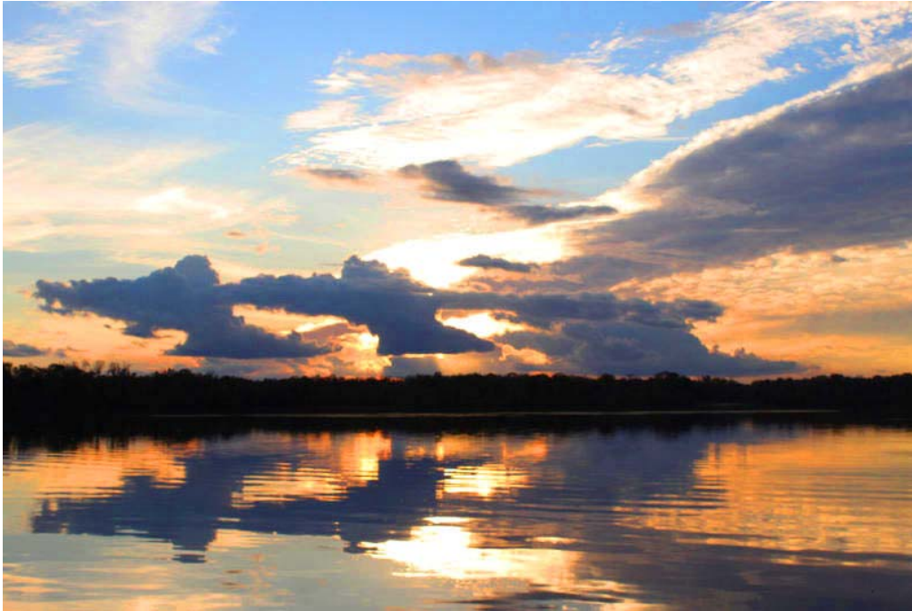
Clouds on the St. Johns