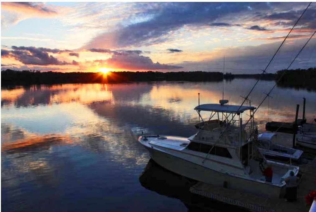
Sunset at the clubhouse